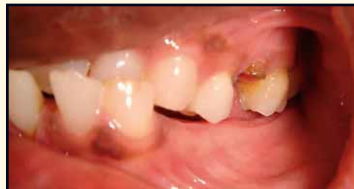
Figure 2C: Left lateral intraoral picture shows extrusion of upper molars. In addition to extrusion, crossbite relationship is observed on posterior (lower ridge is touching buccal cusp of upper instead of lingual cusp).

The lateral ceph showed dental and skeletal class III relationships. The Wits was -4mm, ANB was 0 degrees, SNA was 92 degrees and the SNB was 92 degrees (bimax protrusion). The reversed occlusal plane, deep bite tendency showing GoGn of 27 degrees, and flared out lower incisors showing lower incisor to NB at 12mm were also present. First, we decided to place lower implants (biohorizons 4.0X10mm and novelbiocare 4.2X10mm) slightly distal in order to use them as anchorage to retract the lower anteriors and premolars1 (figure 4). Then, after the lower implants integrated with bone, we planned to open up the bite using lower permanent implants, and protract the upper incisors and intrude the upper molars with TADs3. The patient received a 2nd opinion by another orthodon-