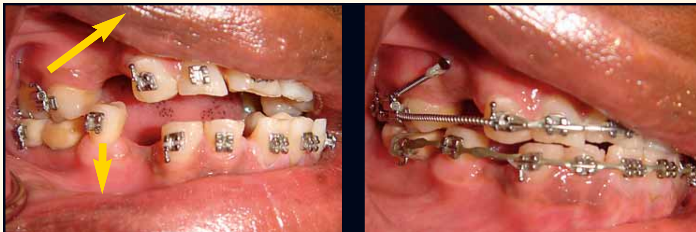
Figure 7A & 7B: The TAD was placed in the area of #5 and #12 at the level above the mucogingival junction (in mucosa) to intrude the upper molars and protract the maxilla.

tist/oral surgeon. They recommended the extraction of healthy upper molars due to severe extrusion and Le Fort Surgery to bring the maxilla forward. In this article, we will show how two small screws (1.6X10mm TAD, Ortho Organizer, Calsbad, CA) preserved the healthy 4 maxillary molars by intrusion and protracted the premaxilla saving the patient from having Le Fort Surgery.