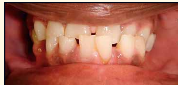
Figure 2A: Frontal intraoral picture showing anterior spacing, unusual wear of the incisor, and a periodontal defect due to occlusal trauma.