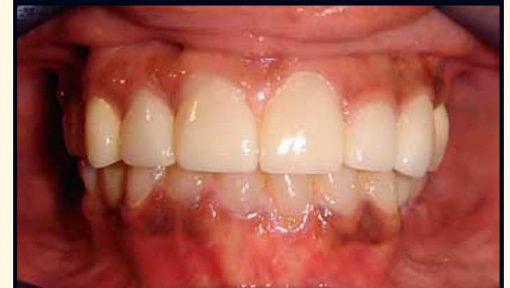
Figures 8A, B, C & D: Comparison of pre ortho, post ortho, and post restoration. Notice we treated the class III collapsed crossbite to a class I overjet.