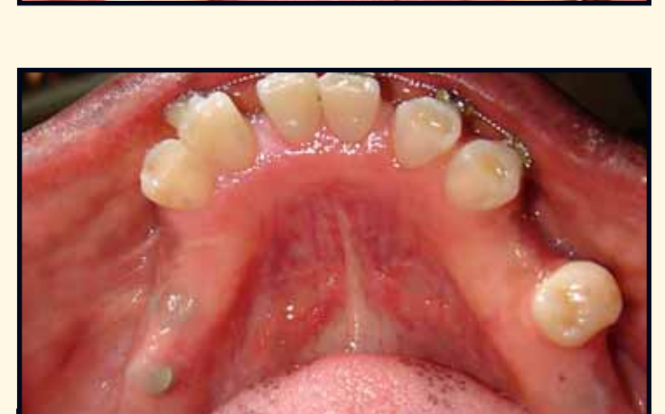
Figure 5C & 5D: Lower implants are placed slightly distal to retract the lower incisors and premolars to lessen the class III dental problem.