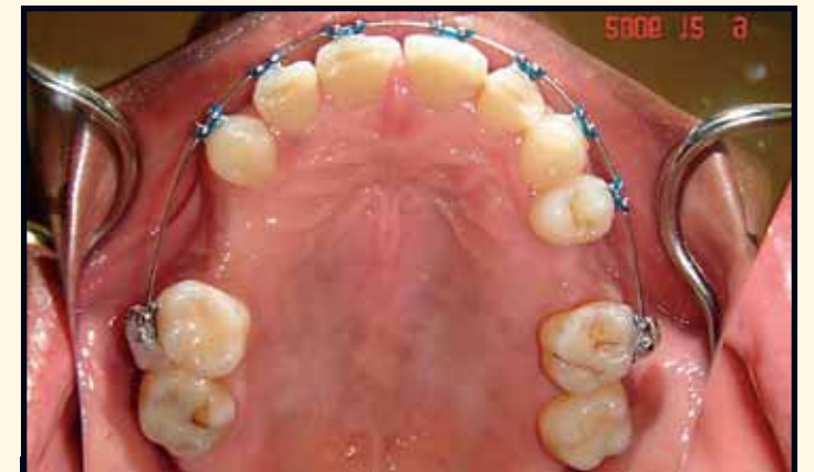
Figure 5A & 5B: Initial leveling and aligning to correct flared out incisors while waiting for the implants to integrate.