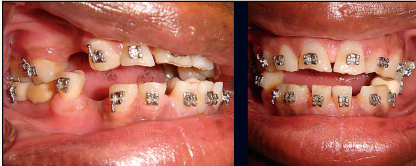
Figure 6A & 6B: After 2nd stage lower implant surgery. 8mm anterior openbite and crossbite due to extrusion of upper molars and skeletal class III relationship.