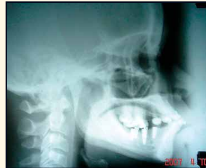
Figure 3A: Lateral ceph before orthodontics