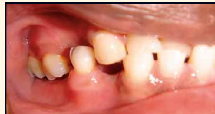
Figure 2B: Right lateral intraoral picture shows extrusion of upper molars and #29. In addition to extrusion, a crossbite relationship is observed on the posterior (lower ridge is touching buccal cusp of upper instead of lingual cusp).

In the winter 2008 edition of this journal, we described how to surgically place temporary anchorage devices (TAD, aka ortho implants, mini implants, micro implants). In this article and in the following edition, we will introduce individual cases that involve TAD's and their mechanics.