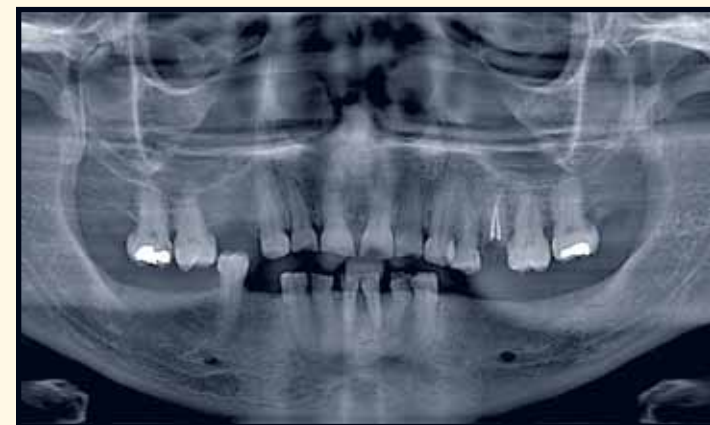
Figure 1: Preoperative panoramic radiograph shows extrusion of upper molars and lower premolar. Anterior spacing and abnormal enamel damage are due to the occlusal trauma.

By Samuel Lee, DDS, Grace Kang-Lee, DDS & Kevin La, DDS