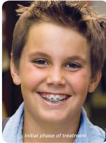
Brackets featured: Di-MIM® Mini-Twin® Brackets