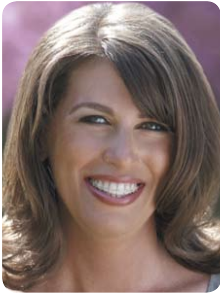
Brackets featured: NeoLucent™ Ceramic Brackets